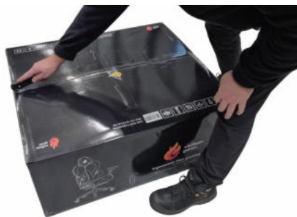
Open the box with a box opener.