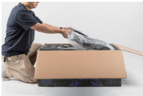
Lay out all accessories from the box neatly.